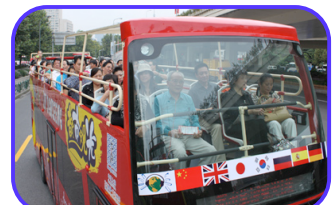
Sabian Symbol 10/23/14 Scorpio New Moon: A crowded sightseeing bus on a city street

The 2014-2015 fully eclipsed cardinal blood moon tetrad portends stages of chrysalisation – the 4 angels of the Apocalypse, bearing the winds of karma, enjoined by dharma to seal/re-enforce/preserve justice and equality on earth. With the third blood moon in Libra, and its ruler Venus rising in conjunction this summer to Jupiter, creating a rarefied star, only active faith, hope, and love lead the way into 2016.