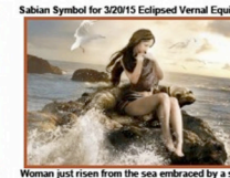
Sabian Symbol for 3/20/15 Eclipsed Vernal Equinox

Knowing we’re all in this together: since the spring of 2014, we’ve been on a fixed trajectory of customs versus compulsions that determines a crowning Jupiter/Uranus fire trine of dramatic innovation and breakthrough in 2015!