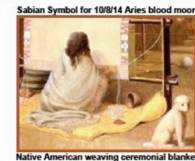
Sabian Symbol for 10/8/14 Aries blood moon

These same 4 full moon blood Lunar Eclipses are linked by March’s new moon Total Solar Eclipse over Jerusalem at midday on March 20, 2015, before Passover, and on next year’s vernal equinox - the astronomical start of spring!