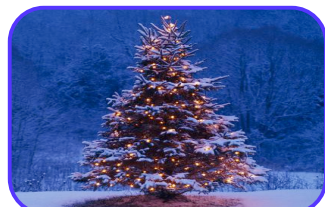
Sabian Symbol 4/29/14 Taurus New Moon: A fully decorated Christmas Tree